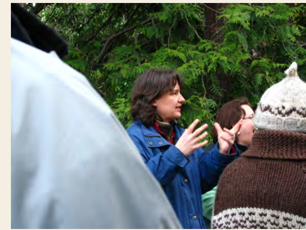
Western red cedar

LatCamera_C_Dec Elevation LatCameraDeg Slope LatCameraMin Aspect LatCameraSec LongCamera_C_Dec LongCameraDeg LongCameraMin LongCameraSec LatPlant_C_Dec LatPlantDeg LatPlantMin LatPlantSec LongPlant_C_Dec * GPS Coordinates LongPlantDeg LongPlantMin LongPlantSec